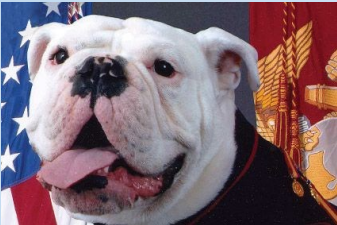
Chesty likes that