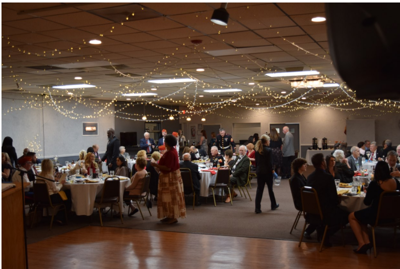
A great venue for a Birthday Ball