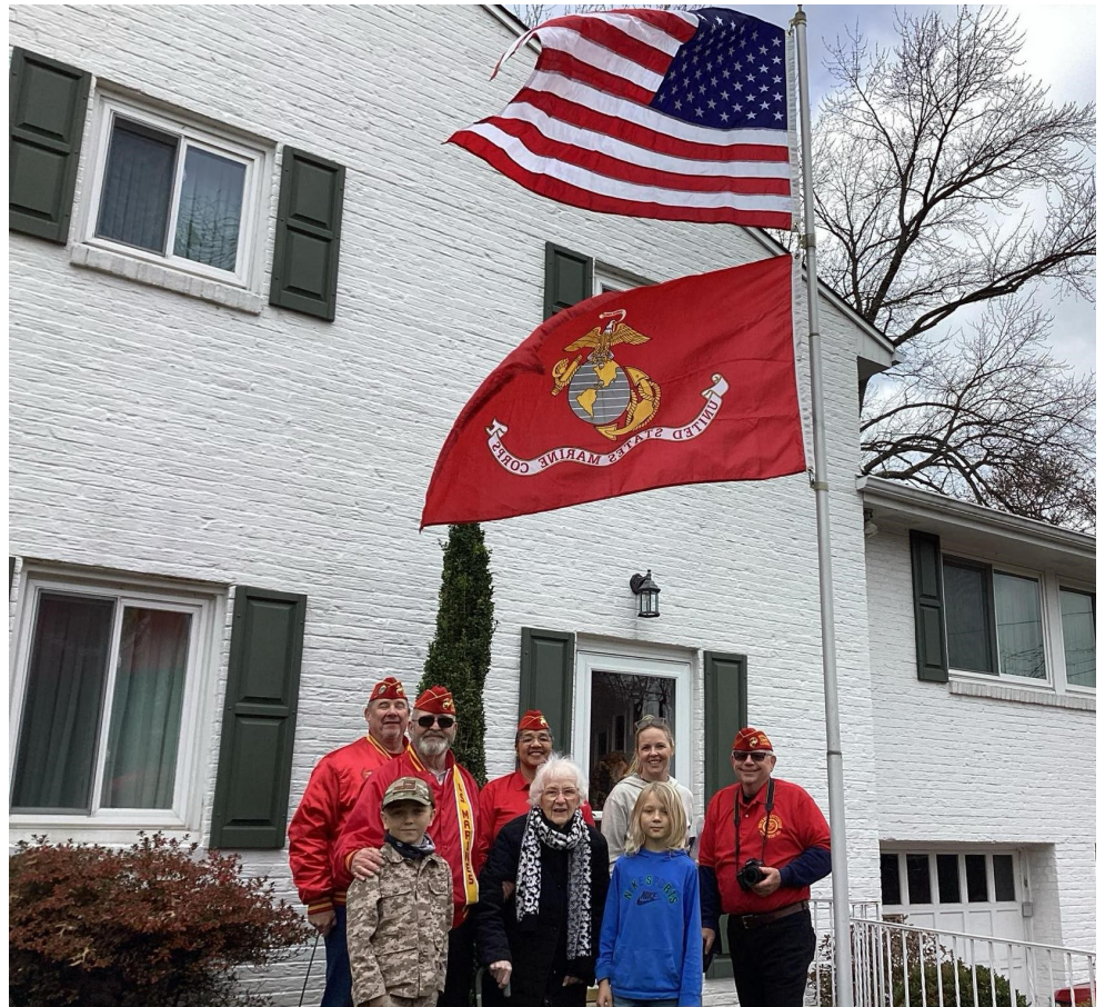
A F T E R