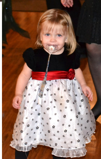
"Belle of the Ball"