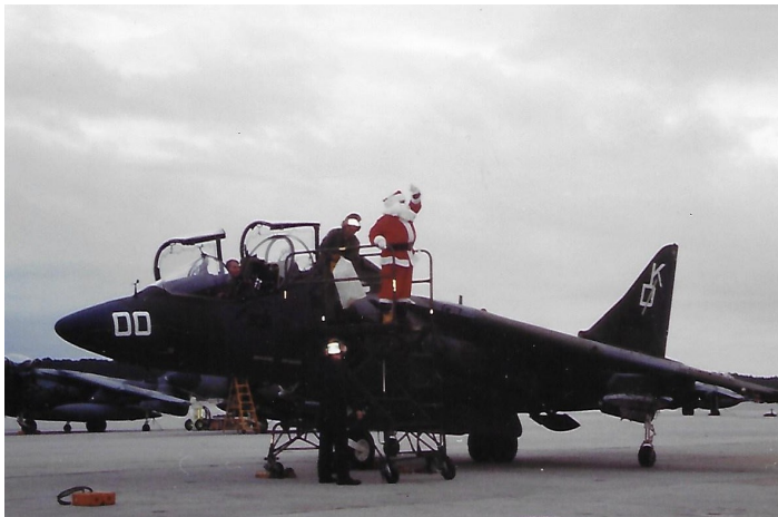
VMAT-203, Cherry Point, NC

Year 1991, sister squadrons were deployed to the middle east during Christmas a time when parents were unable to be with their families. A training squadron stood up to assist the families of other squadrons to give the children a Christmas. Low and behold Santa arrived by Harrier Jet as the reindeer were resting for the night of travel all around the world and yet Santa had a duty to perform. (wasn't his favorite mode of travel)