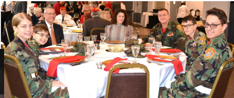
Keystone Young Marines