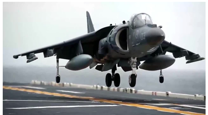
Aircraft Maintenance Chief of a Harrier Jet Squadron