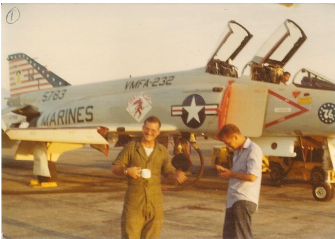
Aircraft Hydraulic/Pneumatic Mechanic